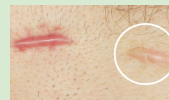
Right scar treated for 2 months, left scar remained untreated