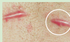
Before treatment Age of scars: 14 months